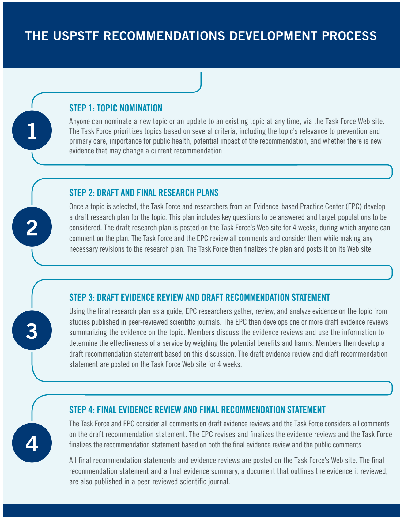
Figure 2. Steps the USPSTF Takes to Make a Recommendation